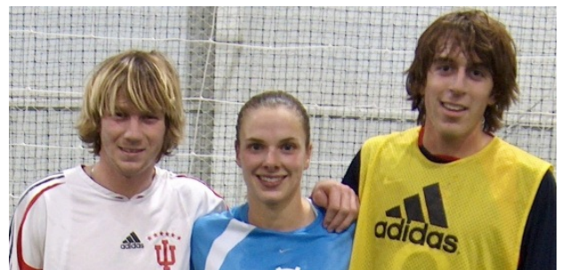
What do these highly accomplished soccer players have in common? See inside for details.